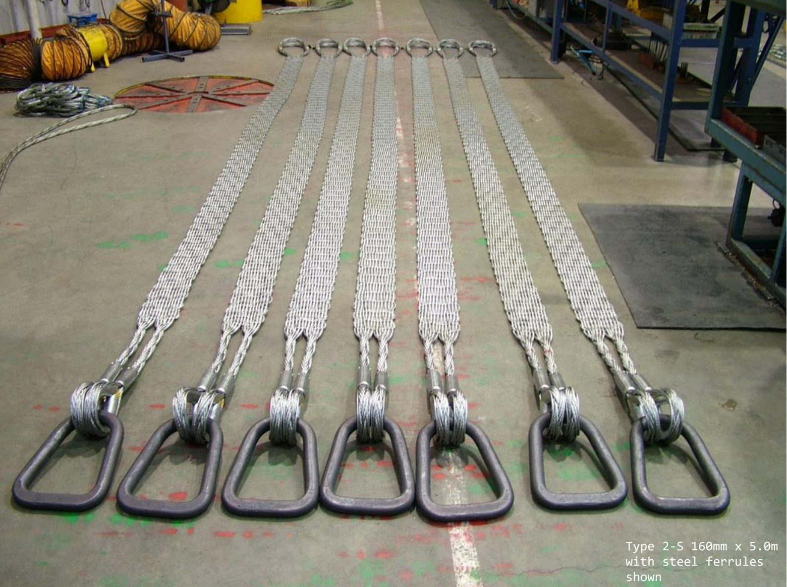
Type 2-S 160mm x 5.0m with steel ferrules shown

Flat Woven Steel slings manufactured by Andromeda are very flexible as I've seen them basketed close to capacity around steel beams with no kinks after use. Even FSWR slings basketed under moderate loads with packing around a steel beam shall get kinks and I would not consider using wire rope slings in the same way as they would be kinked even with edge protection in use.