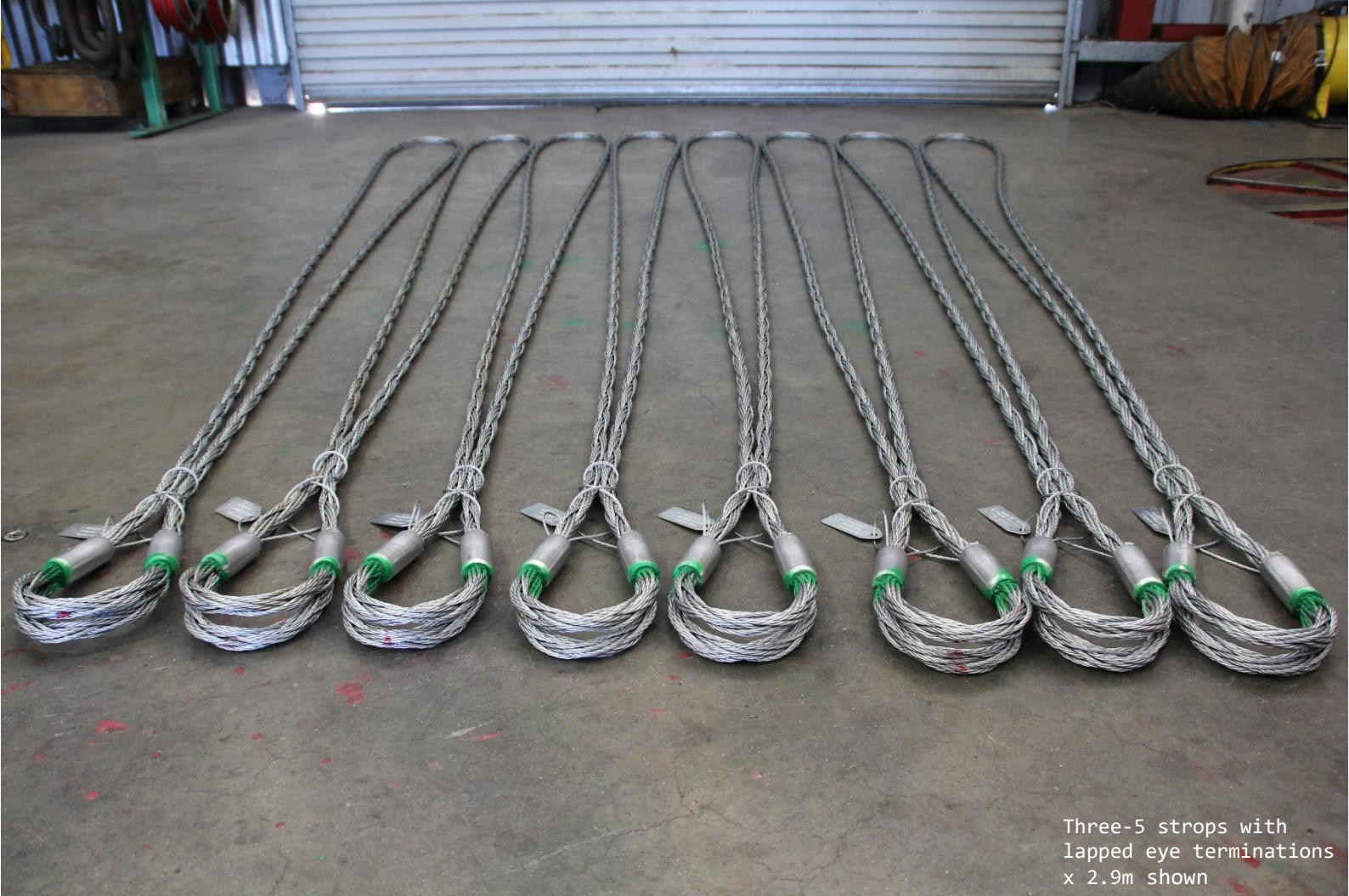
Three-5 strops with lapped eye terminations x 2.9m shown

I started as a tradesman with Norfolk Island Electricity in 1987. To lift big loads in the powerhouse we used very flexible wire strops. In 1989 after becoming manager I enquired about the same type of flexible strop for lifting power poles. Since 1987 we have used Andromeda strops for lifting heavy equipment in the generator room and since 1989 for removing old power poles and lifting new poles in place. So in 2016 we are still using plaited strops for general rigging and to lift power poles. I would recommend to them to industrial users for general rigging and standing power poles due to their secure grip, durability and good value.